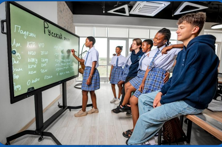
STUDYING RUSSIAN LANGUAGE AND HISTORY