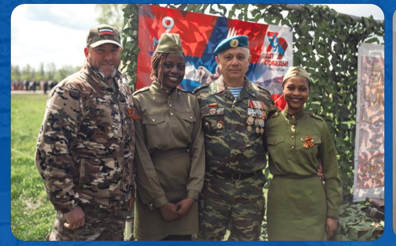
ENGAGING IN NATIONAL HOLIDAYS